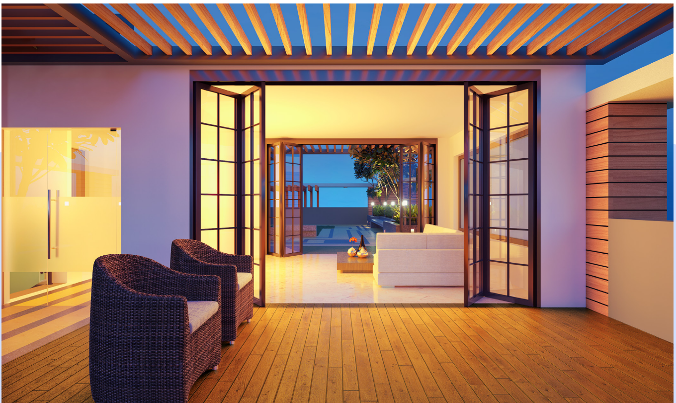
Senior Citizen's Deck