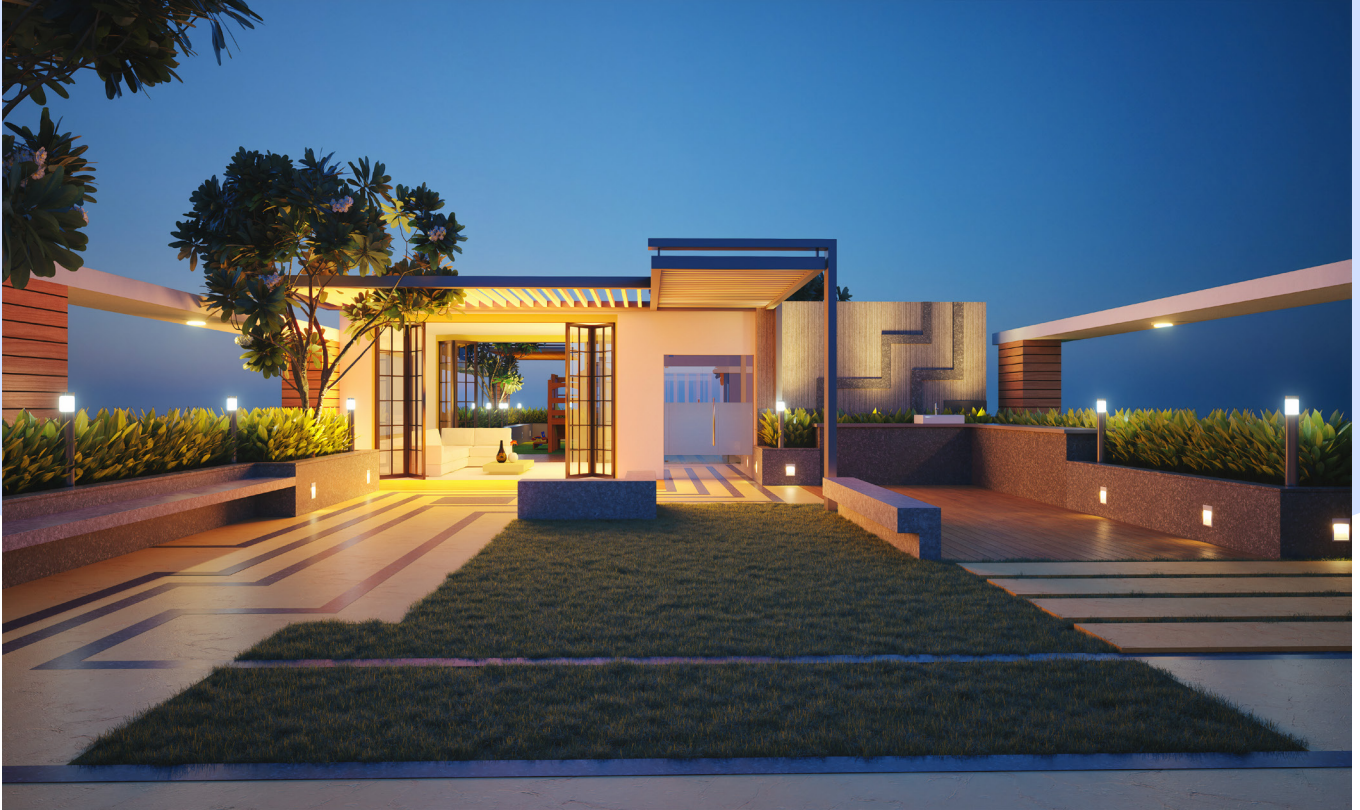
Beautifully designed landscape on terrace